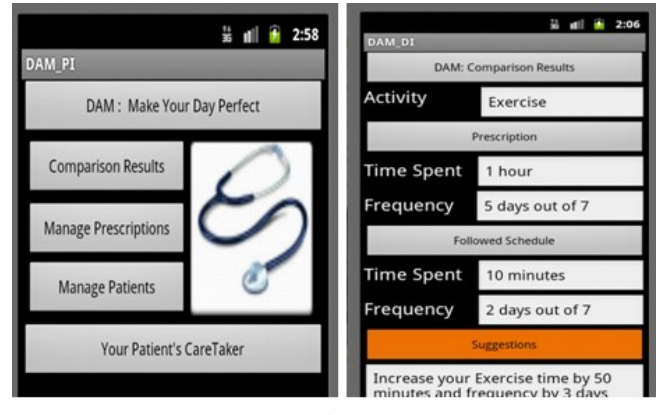
Figure 5. (a) Practitioner Interface

The second mobile client of DAM is designed for practitioners to assist them in user monitoring and controlling (add/edit) of prescribed schedule. A snapshot of this interface is shown in Figure 5. The Comparison Schedule option is for showing comparison of Prescribed Schedule and Followed Schedule of the user. It is exactly the same as described in the Patient Mobile Client Interface and shown in Figure 5(b). The purpose of this is to update practitioner regarding the status of users.