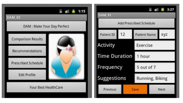
Figure 3. (a) User Interface

Figure 4(a) describes alert message for adding Semantic tag. This message is prompted to user when a new place is visited and tag for this place does not exist in repository. So the user is asked to provide semantic tag by giving Geo tag and visit time of that location. The example in Figure 4(a) includes a lunch activity which user performed at Coex mall at 13:30.